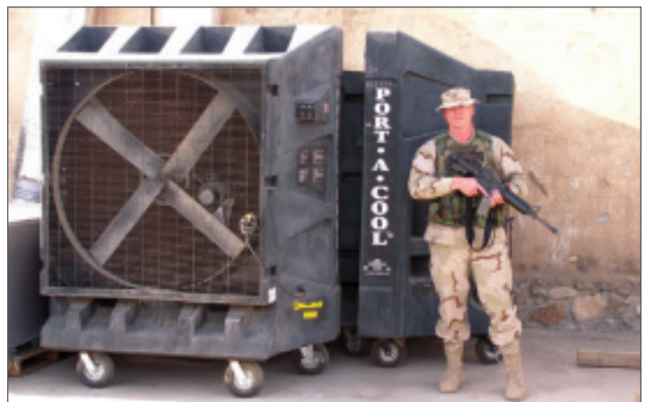
Portacool, LLC has proudly kept our military and warfighters safe and cool for more than 20 years.

Portacool evaporative coolers provide dramatic airflow and coverage. With our products cool air can be felt up to 300 feet away depending on the product. Using only about 264 kilowatt-hours and costs of just over $1 to operate per day on average, Portacool evaporative coolers are the most energy-efficient cooling products on the market.