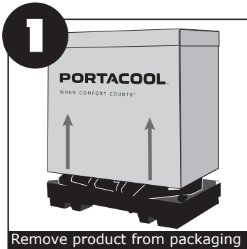
Remove product from packaging