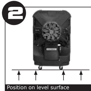
Position on level surface