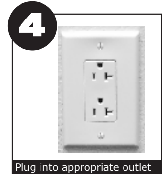
Plug into appropriate outlet

5 For setup, KUUL Comfort™ evaporative media should appear wet before starting the fan. Check the water gauge to monitor water level in tank. The water adjustment valve on each portable evaporative cooler is set at max flow. However, ensure the knob is turned completely to the right before use. Turn to the left to increase water flow. If entrainment occurs - water is spitting from the front of the product - use the valve to decrease the water flow until entrainment ceases.